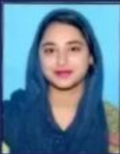
Bazila (10th Position 7th Semester)