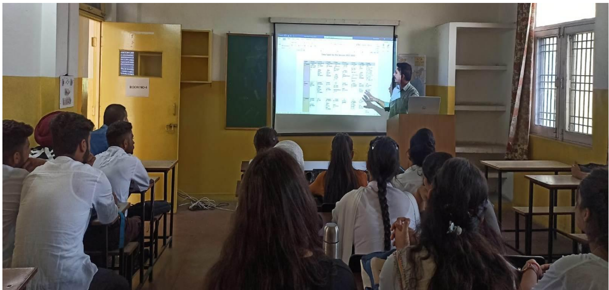
ICT enabled learning