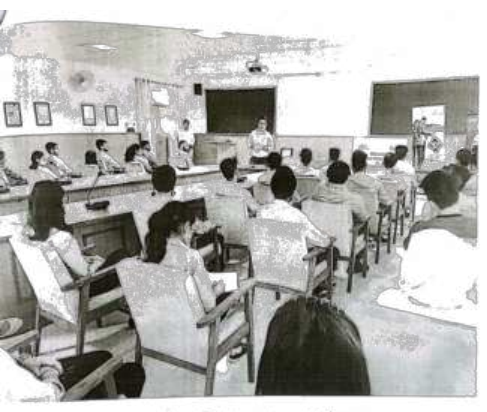
G.L by Bharnt Blaum