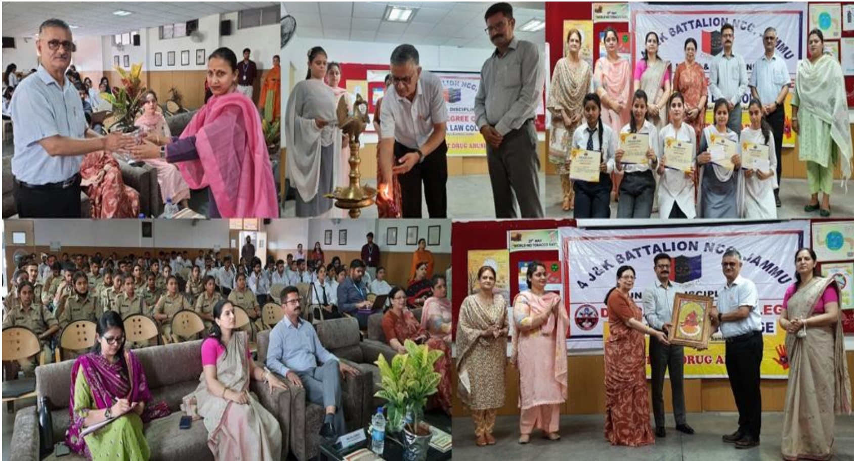
World No Tobacco Day