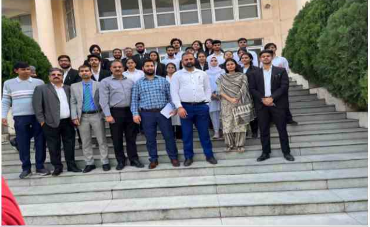
10 Extension lecture by Justice Tashi Rabstan on National Law Day